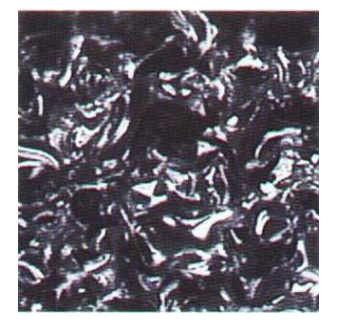
RFS - IS 75% compressed